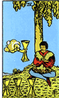
Loss in Pleasure